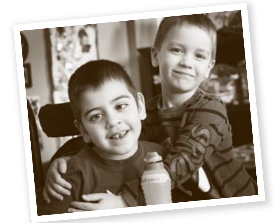
Below: Playing together at Hope's Homes .

children with complex medical needs and their families in mind.