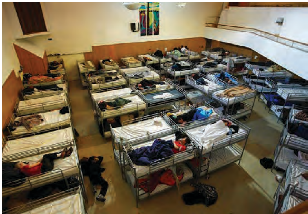
First United Church homeless shelter

This is a report provided to the RCY by a public body responsible for providing a reviewable service to children and youth, as required by sec. 11 of the RCY Act . A Reportable Circumstance Report is made after a critical injury or death of a child who was receiving, or whose family was receiving, the reviewable service at the time of, or in the year previous to, the critical injury or death.