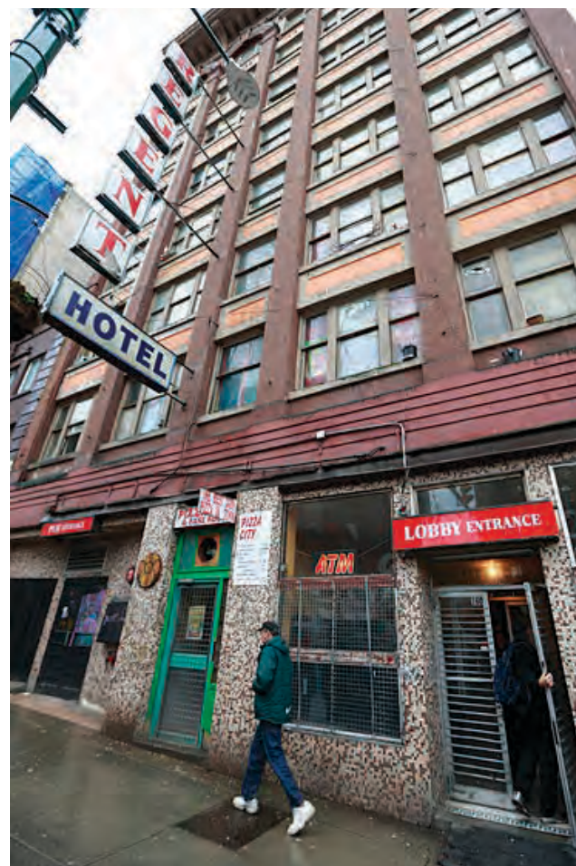
A man walks past an SRO hotel in the DTES

During interviews with contracted agency staff, the Representative’s investigators found that there were no formal written reporting requirements between outreach and MCFD. Outreach workers were only required to record “contacts” with clients, which could