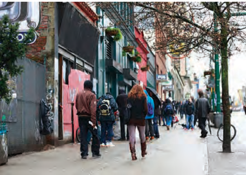
Looking down a DTES street

Between the ages of 16 and 19, Paige drifted through more than 50 locations, mostly in the DTES – among homeless shelters, safe houses, youth detox centres, temporary accommodations with relatives and friends, two ministry foster homes and various DTES SRO hotels.