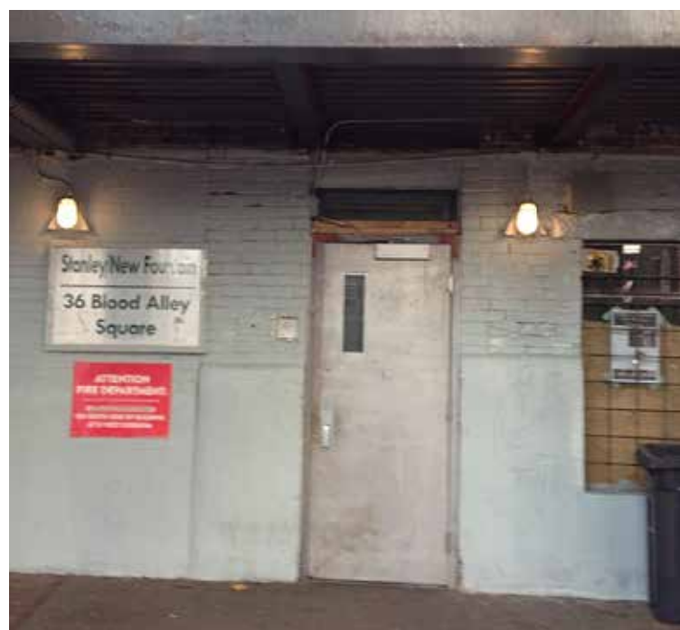
Entrance to the Stanley Hotel

“They didn’t come to the shelter, everything was done through letters and correspondence – they never visited the program or met the staff to find out what was going on. They didn’t seem that interested.”