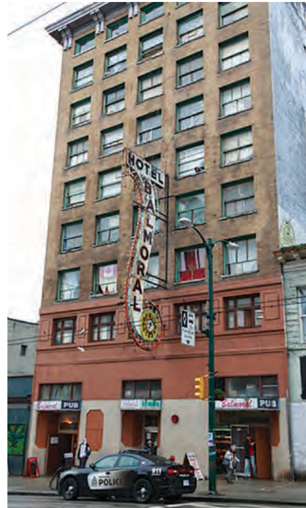
The Balmoral SRO hotel