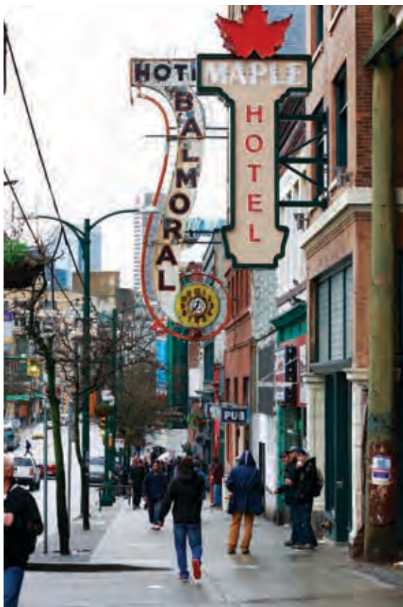
DTES street with Balmoral Hotel